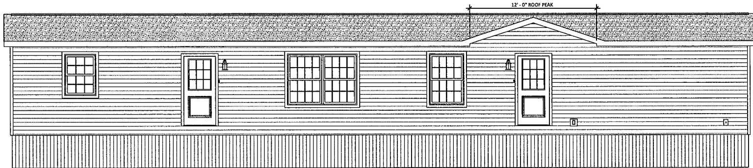
MINI HOME - FRONT ELEVATION